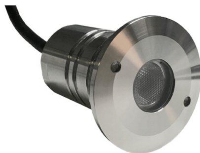
UX-50-1023 Threaded Flange for 1.5" F.I.P.