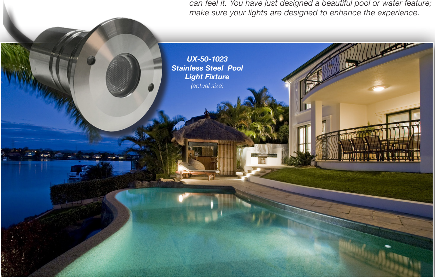
UX-50-1023 Stainless Steel Pool Light Fixture (actual size)

When form and function come together in perfect harmony you can feel it. You have just designed a beautiful pool or water feature; make sure your lights are designed to enhance the experience.